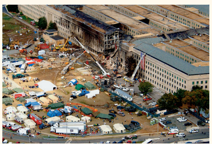
▲ The strike on the Pentagon left a charred, gaping hole in the southwest side of the building.

Stunned bystanders look on as smoke billows from the twin towers of the World Trade Center.